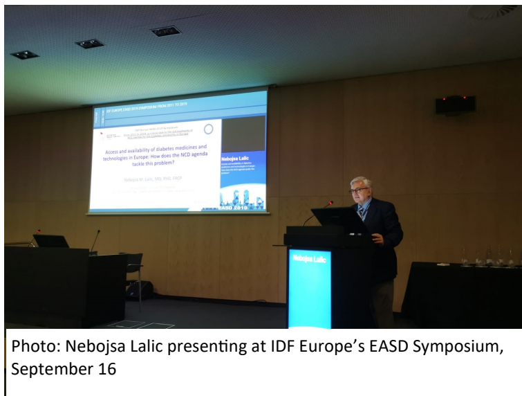
Photo: Nebojsa Lalic presenting at IDF Europe's EASD Symposium, September 16

groups were put together, by inviting all interested IDF Europe members. These will each release a paper focused on one of the most important themes identified during the meeting — diabetes registries, early access to care and multi-level care. The papers will be published by the time of the IDF Congress in