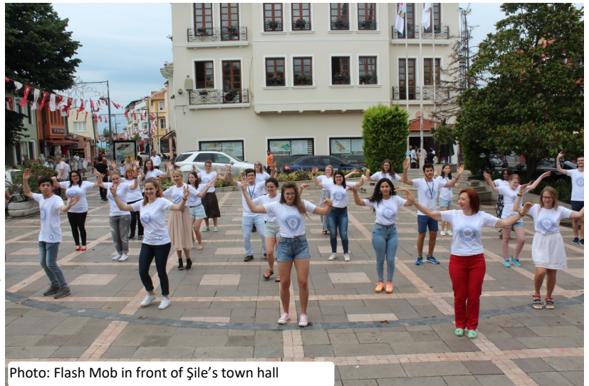
Photo: Flash Mob in front of Şile’s town hall

Turkish Diabetes Foundation, which we wish to thank for their amazing support.