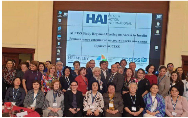
Photo: Participants at the Bishkek HAI meeting, 14-15 October

The two-day meeting provided an opportunity to discuss barriers and opportunities regarding insulin access in the region. HAI shared the findings and interventions gathered over the past four years of the ACCISS Study. More information and tools can be found here: ( http://accisstoolkit.haiweb.org/ ).