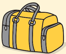
Diabetes Emergency Kit