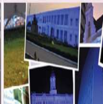
Blue Lighting all iconic buildings