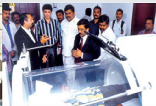
HBOT for advanced wound healing