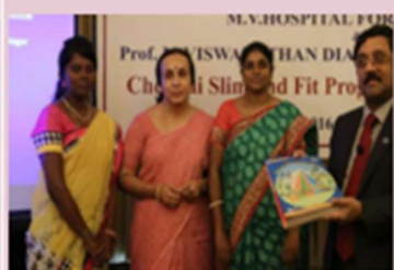
Chennai Slim & Fit Programme in Schools