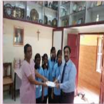
Financial aid to School for Blind on International Women's Day