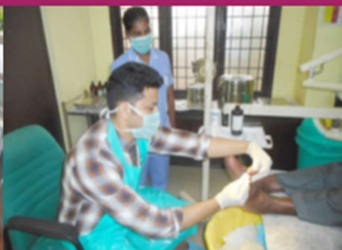
Transcutaneous Oxygen test (TCPO2)