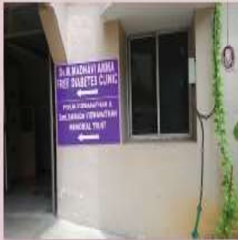
Free modern diabetes treatment