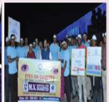
World Diabetes Day – Spreading awareness about Diabetes