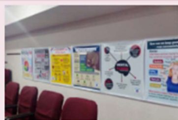
World Health Day – Awareness programme