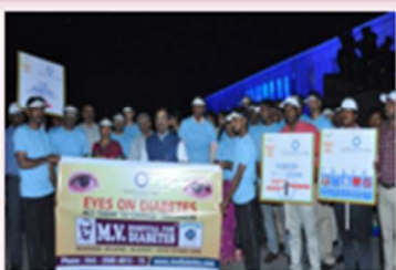
World Diabetes Day – Spreading awareness about Diabetes