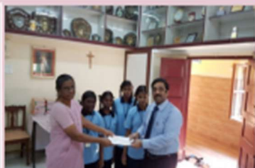
Financial aid to School for Blind on International Women's Day