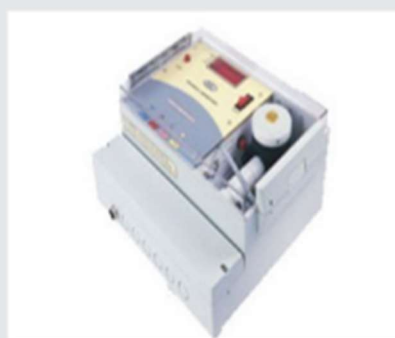
Sensitometer HCP (Hot, Cold, Pain) to test nerve damage