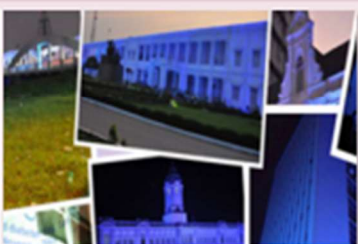
Blue Lighting all iconic buildings