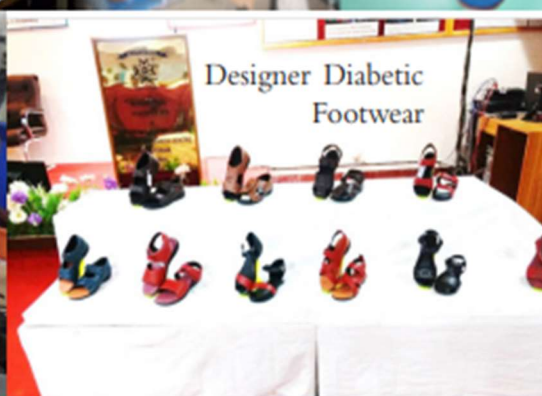
Designer Diabetic Footwear