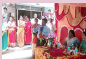
World TB Day – Spreading Awareness