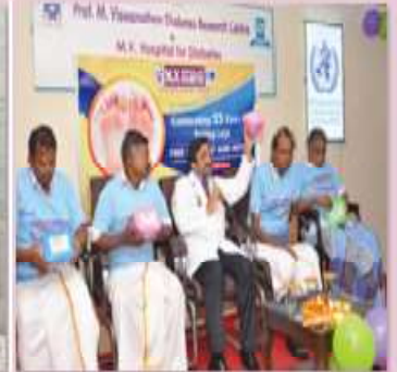
25 years of saving legs – free foot care kits