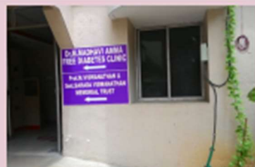
Free modern diabetes treatment