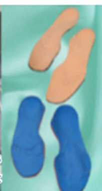
Moulded insoles to protect feet