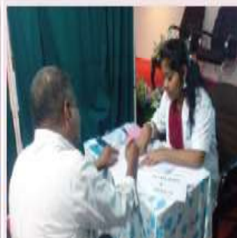
Free Health Check up