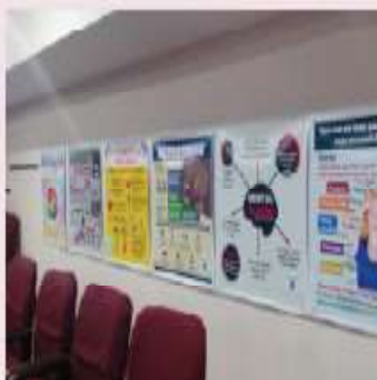
World Health Day – Awareness programme