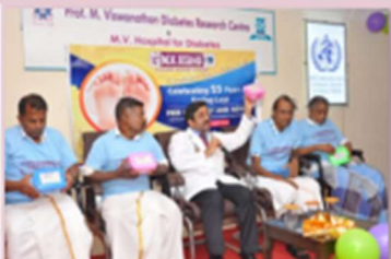
25 years of saving legs – free foot care kits